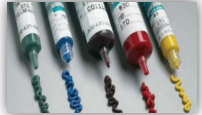
Diamond Lapping Compound